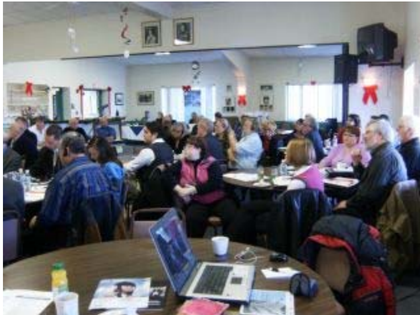
Some of the attendees at the symposium