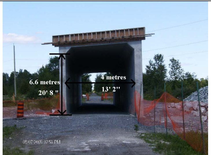
New Overpass (culvert) on Hwy 7