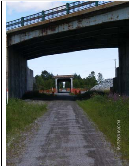
Old and New Overpass on Hwy 7