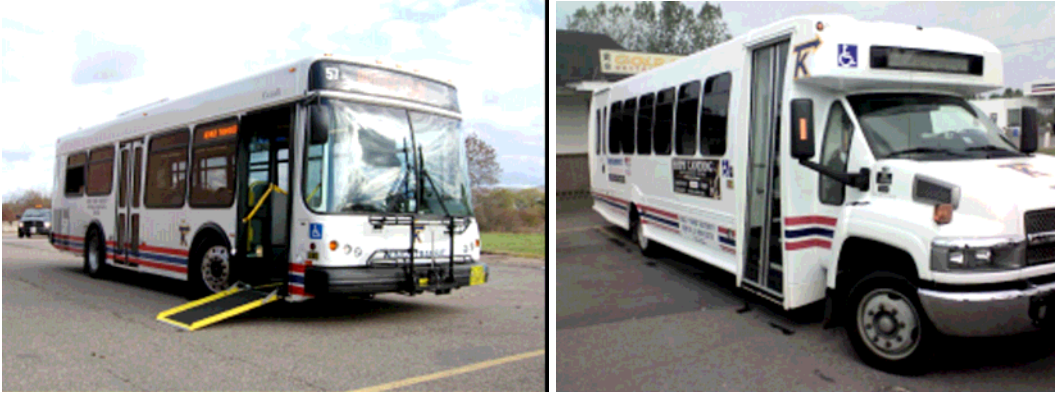
(The above images were taken from the PowerPoint Presentation)

The service serves the following municipalities in Nova Scotia: