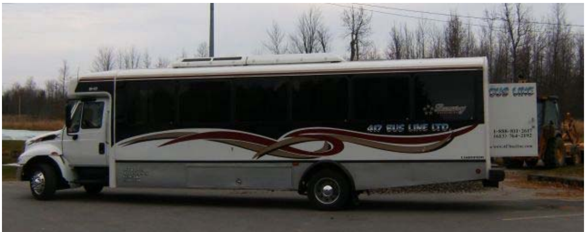
A Transit bus from 417 Bus Lines

To view all documentation www.transportpontiac-renfrew.ca