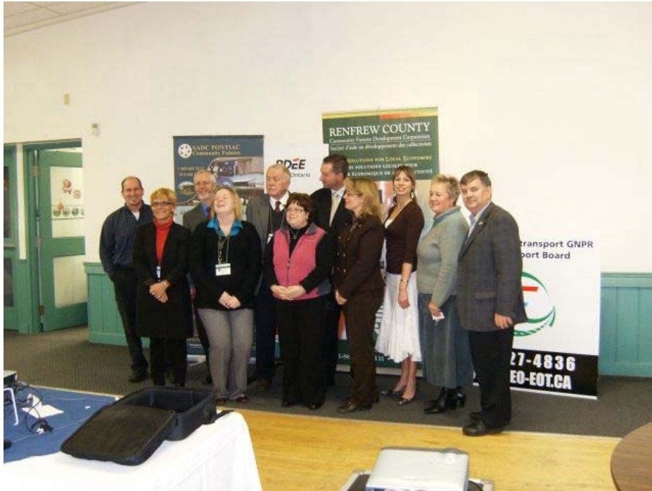
Some of the organizers of the Symposium