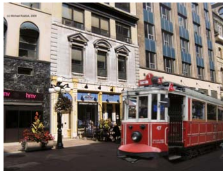
Simulated depiction of streetcar on Sparks Street

Run a small-sized, heritage-style streetcar on a single track along Sparks Street from the new Convention Centre to Lebreton Flats and the War Museum.